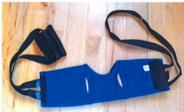
Sample harness I received to review

I recently conducted a trial with my dog, Clark, using the Walkabout Back Harness. The Walkabout company sent XS, S, and SM (small/medium) samples for us to try out. Clark is a paralyzed dachshund who weighs 17 lbs. and has a 6.25-inch thigh circumference. Size "SMALL" (according to the brochure sizing chart of 3"-8") was perfect with a finger's worth of ease for Clark's thighs. The retail price for a "small" Walkabout is $37 plus $10 shipping. www.walkaboutHarnesses.com