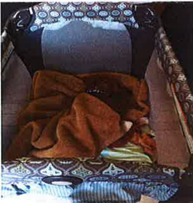
Squeaky is his recovery suite

Thankfully, my mother has been a natural researcher all of her life. When she needs information, she'll leave no stone unturned until she finds what she is looking for. Now confronted with this new and scary diagnosis of IVDD, my mother combed the internet for anything that could help explain what was happening to Squeaky, and what we could do about it. She found the Dodger's List website a few weeks into her search, and then we knew that we had the virtual village we needed to help us take care of our baby. We learned that a bassinet was