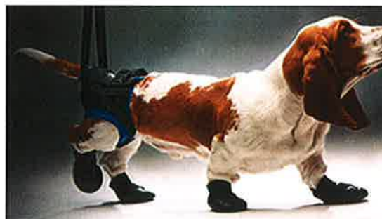
Harness as shown on www.walkaboutHarnesses.com

7. There is an optional $25 suspender to connect a dog's own harness to the Walkabout to keep the Walkabout Back Harness from slipping down. I did not find that I would need to have a suspender because the Walkabout Back Harness stayed in position on Clark whether he was scooting or using it to walk outdoors.