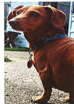
Squeaky enjoying life!

body is off when we might miss it. It has been almost two years since Squeaky had his second surgery, and he is getting stronger every day. His energy level is through the roof, he has a zest for life, and he is as feisty as ever! Looking back on the past few years when there were so many moments of uncertainty and frustration, we can't thank everyone at Dodger's List enough. Through their information and resources, we learned how to deal with IVDD as a family, and how to create the kind of life that, healthy or sick, every animal should have.